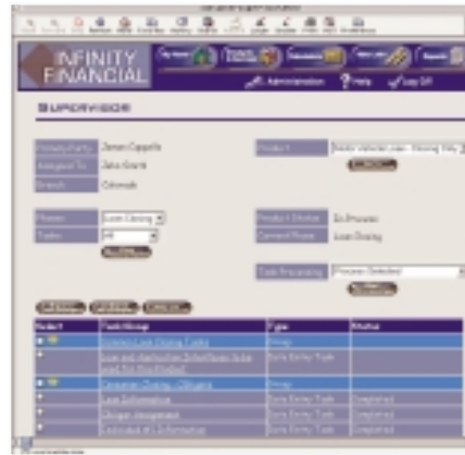
Browser-based financial.center provides click-and-go usability. You can define and streamline your own workflow and check on the transaction status at a single glance.